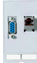
SUB D9/RJ45 4000-68000-1410000