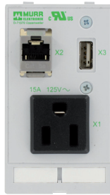
SUB D9/RJ45 4000-68000-4030000