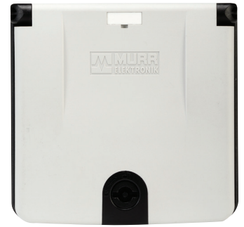
Gray Lid 4000-68524-0000001