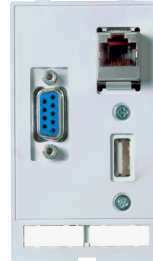
SUB D9/RJ45/USB 4000-68000-1430000