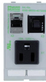
Power/RJ45/3A Fuse 4000-68000-4070000