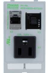
Power/RJ45/3A Fuse 4000-68000-4070000